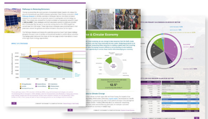
Pages from Clark County, NV's "All In" Plan