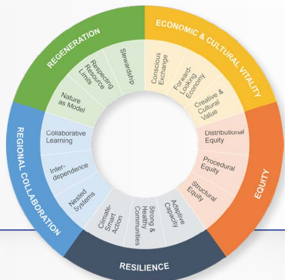
City of Northampton's Resilience and Regeneration Framework