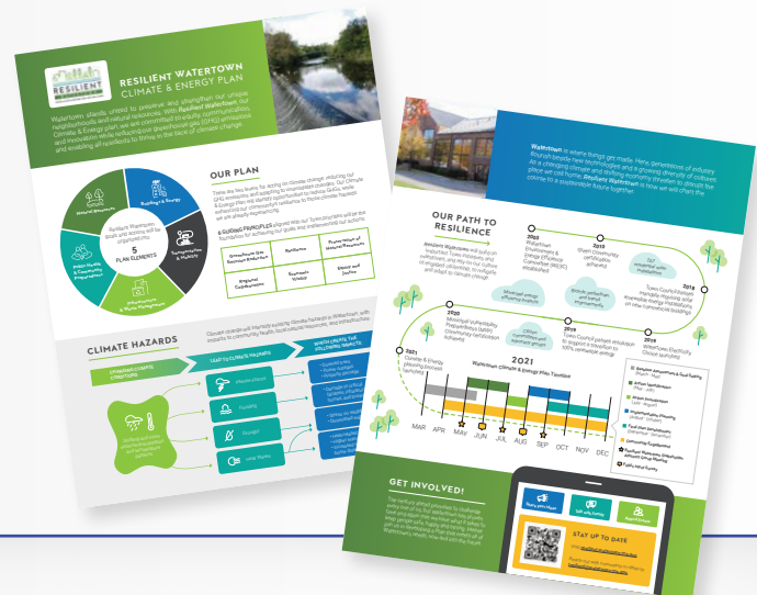
Resilient Watertown Plan Overview Fact Sheet